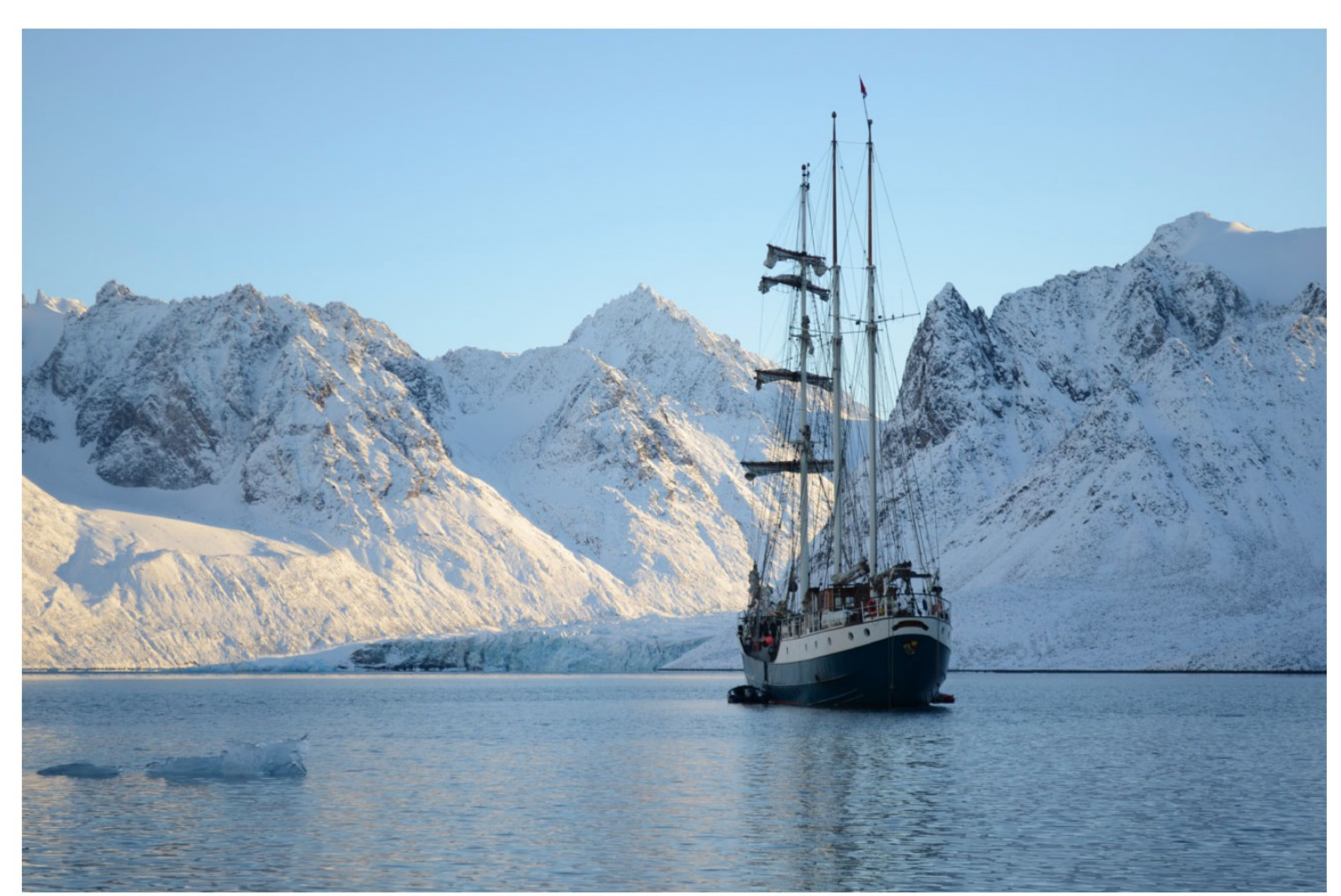
Home for two weeks during this Arctic Circle expedition is a sailing vessel specially outfitted for the extreme conditions (Photo: Beau Carey/The Arctic Circle).